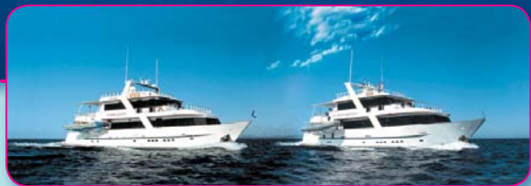
Galapagos Aggressor I & II