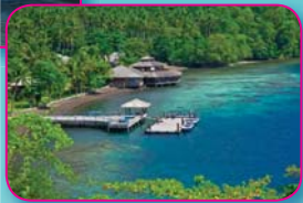
Kungkungan Bay Resort