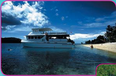
Eco Divers Manado

Volcanoes, rain forests, rice paddies and friendly island culture are found on the lush island of Indonesia. Manado's reef and dramatic walls are laden with corals and are home to varied marine life including reef sharks, napoleon wrasse, giant clams and mudibranchs.